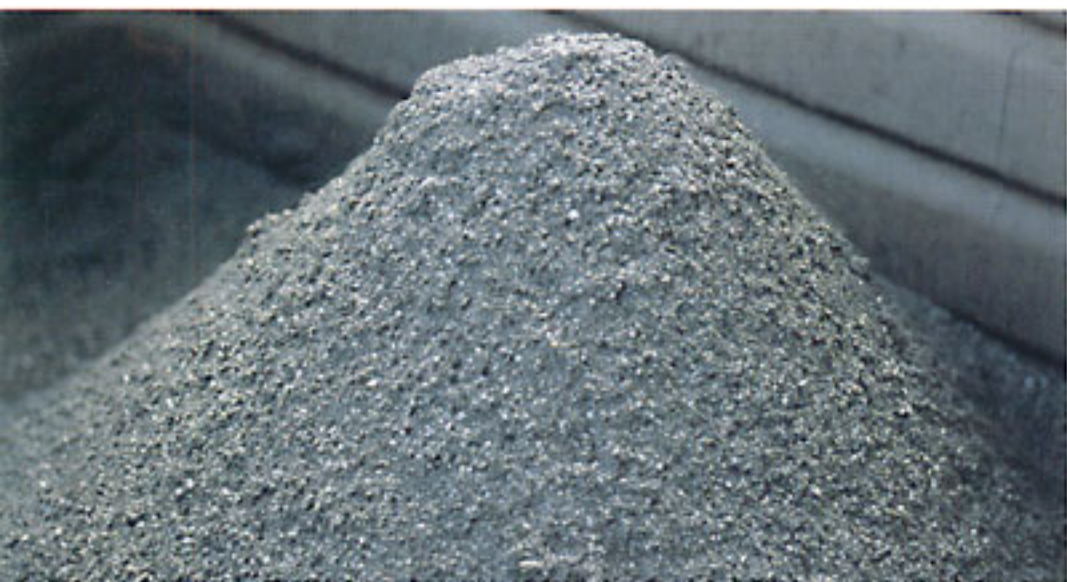
Discharge of dewatered material.

Washing effluents coming from the steel industry with high flows and a low to moderate content of well defined solids like mill scales and slag has been proven optimal for the spiral dewaterer. In the sedimentation tank the wash water is reclaimed and sent back to the washing operation again. The solids are removed by and dewatered in the discharge spiral and can be sent to recycling if this is considered of value.