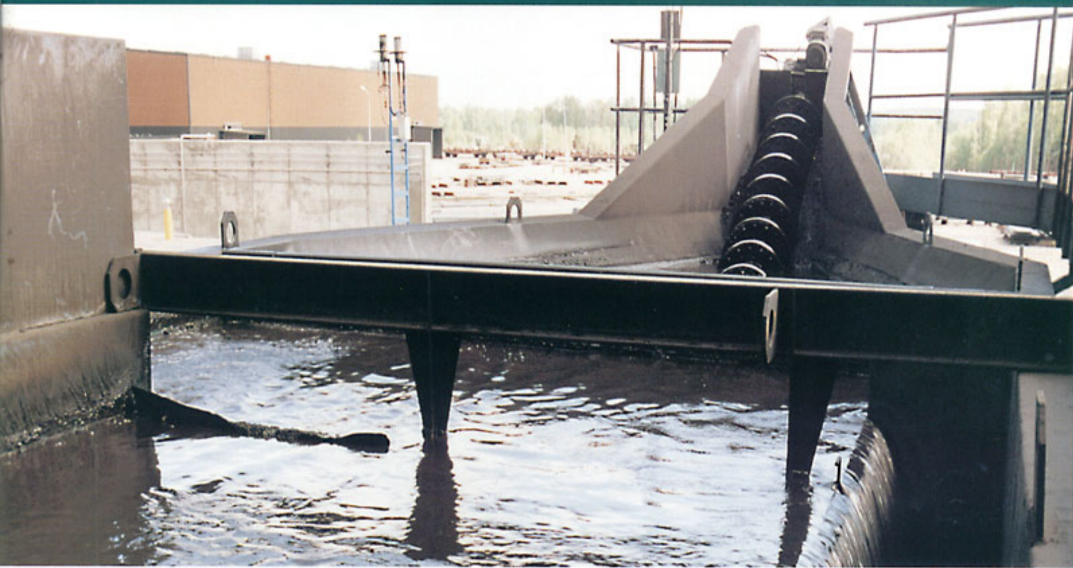
Clarified water overflow.