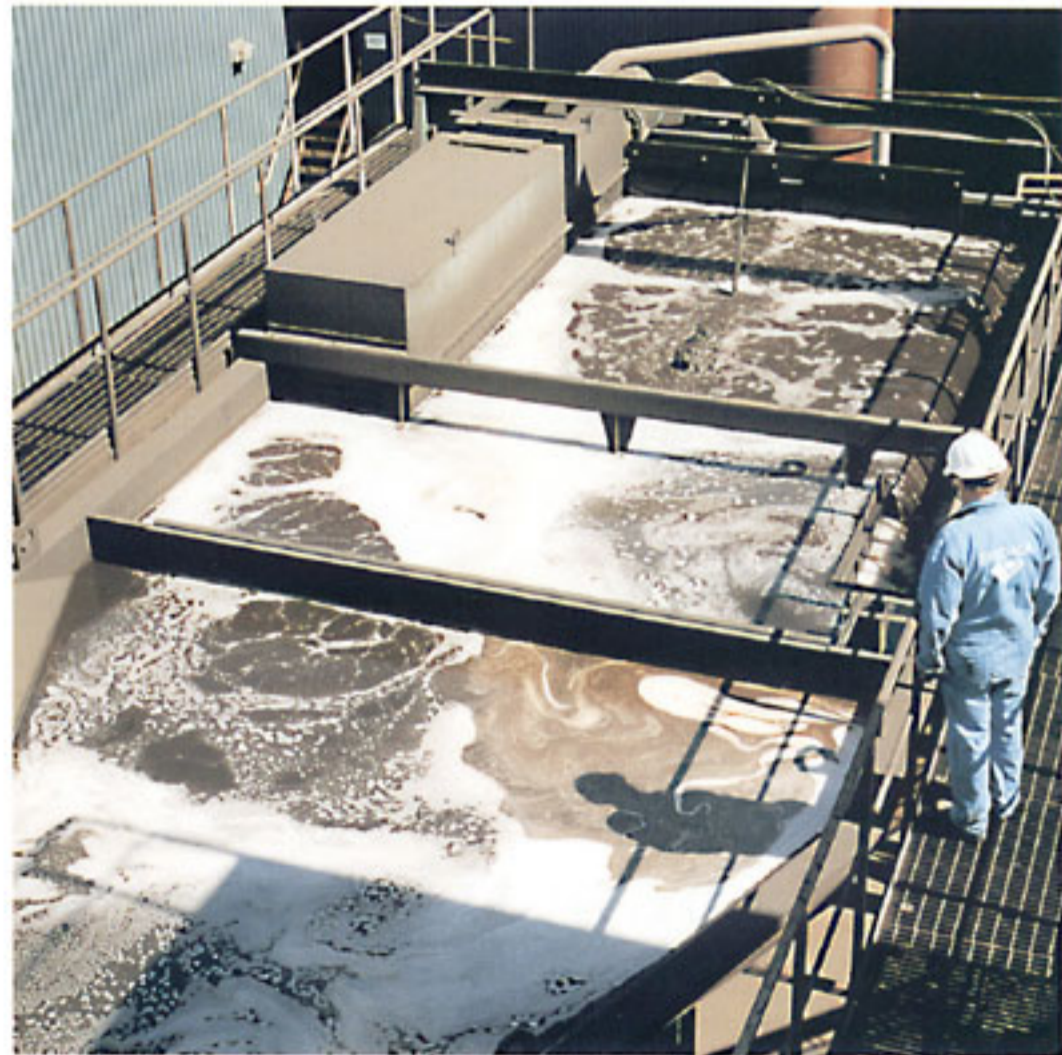
Feed distribution in a SD60-200.

In some applications the feed contains oil and grease. These are floating products reporting to the clear water overflow. A special designed oil skimmer can be supplied for removal of these floating products.