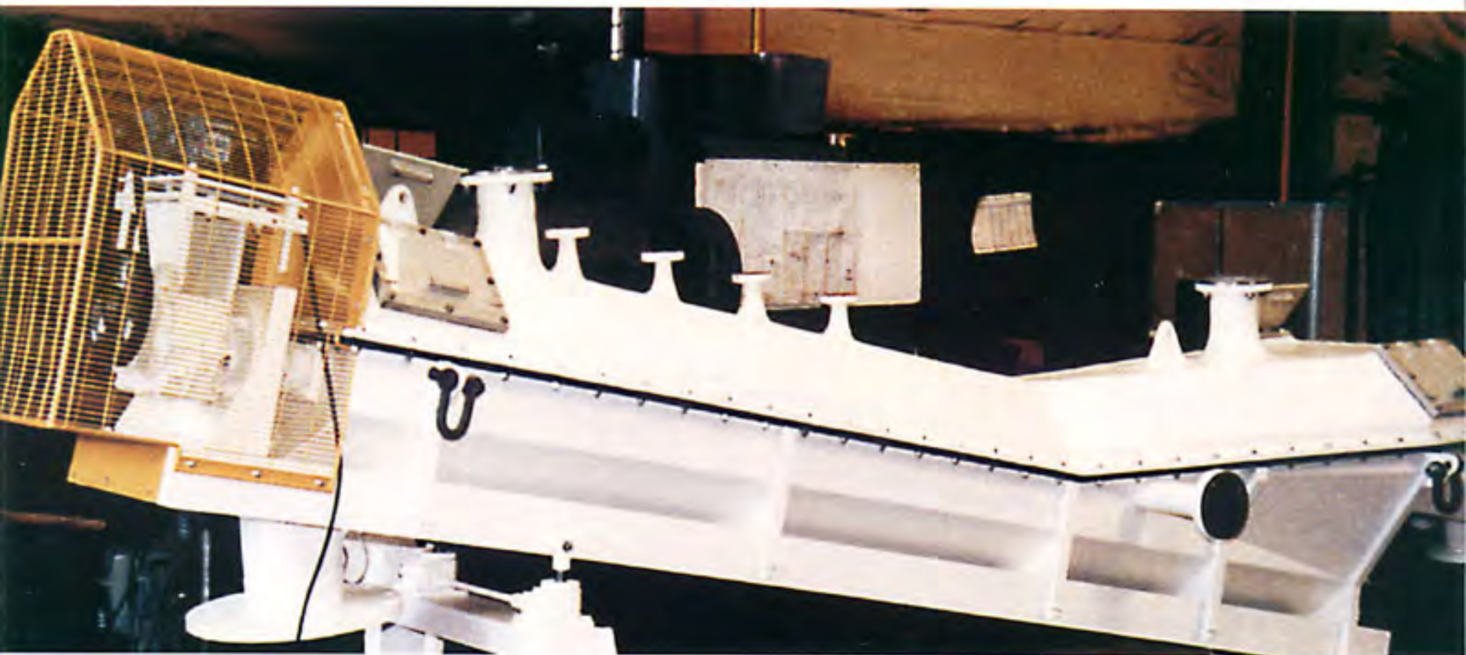
Gas sealed spiral classifiers.