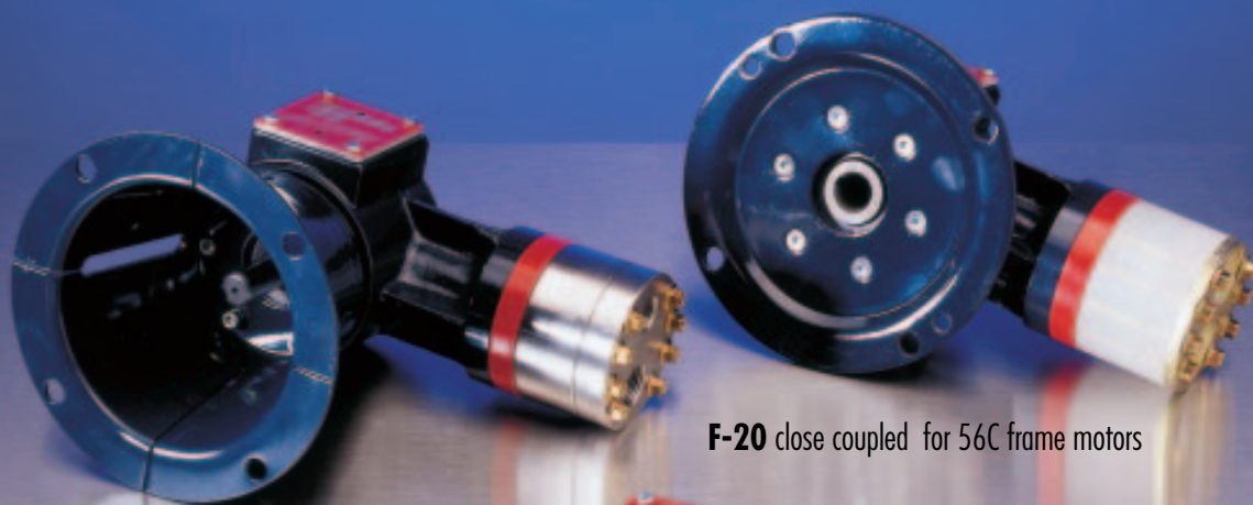
F-20 close coupled for 56C frame motors