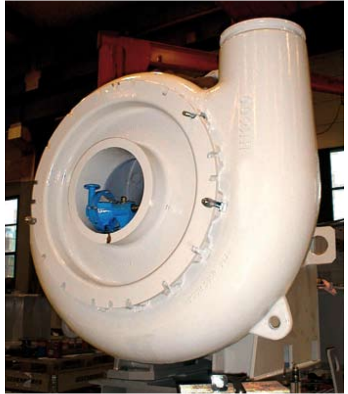
XM 600 with MM25 in the middle

A step was taken to better serve the market with state-of-the-art slurry pumps, and a totally new range of horizontal and vertical slurry pumps has since been launched.